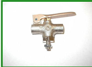
MODEL 258 Durable Elec. Nickel Body, Stem 350 PSI