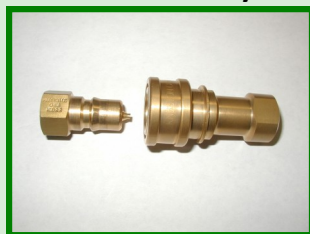
MODEL KQD-2-2 / KQD-2-1 High Pressure - 3000 PSI Sizes: 1/8" 1/4"(shown) & 3/8"