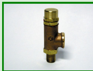
MODEL 103 Up to 1000 PSIG Sizes: 1/8" 1/4"(shown)