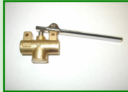
MODEL 251 Truck Mounted Applications 1000 PSI