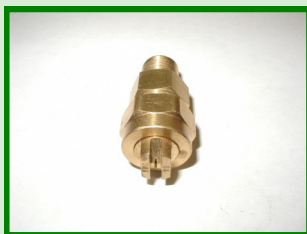
MODEL P172200 110° Width of Spray Flow/gpm: 0.1, 0.15, 0.2, 0.3, 0.4