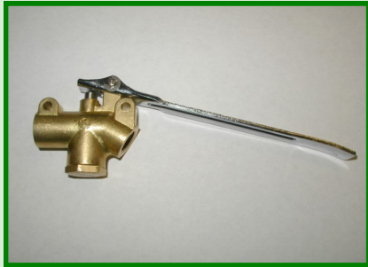
MODEL 251-30 Double O-Ring 1200 PSI