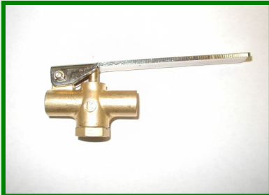
MODEL 253 or MODEL 254 E. Nickel Stem or Brass Stem 500 PSI