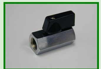
MODEL KMBVF-2 FxF (pictured) & MxF